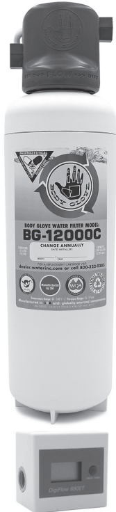
Electronic flow meter, included with this system.